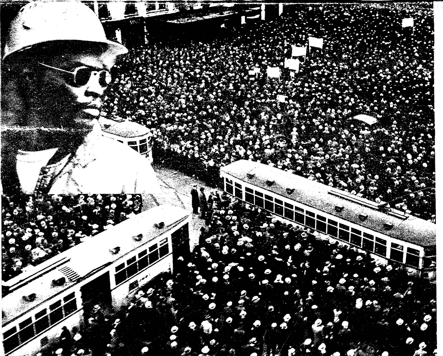
AUTO WORKERS DEMONSTRATE IN CADILLAC SQUARE, DETROIT DURING THE SIT-DOWN STRIKES