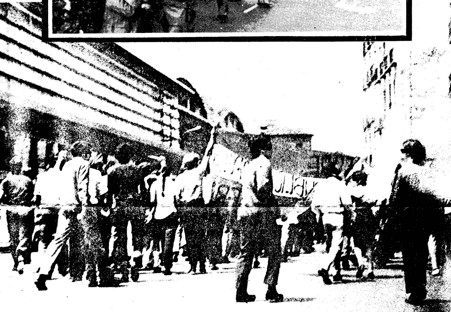
MASS DEMONSTRATIONS OF SPANISH WORKERS SIGNAL THE BEGINNING OF THE EUROPEAN REVOLUTION

strength of the world working class and its youth to the struggle of the fighters of Spain to finish with the last fascist dictatorship in Europe. It decided to take up the fight to rebuild the world party at the side of the International League, to organize delegations of revolutionary worker youth from the USA, Portugal, Spain, France, Germany, and Yugoslavia to the International Fourth Open Conference Rebuilding the Fourth International. A leadership was elected to further plan and carry out the struggle of the RYI to prepare the revolution, to rebuild and build the world party. A full report on its work will appear in INTERNATIONAL YOUNG GUARD and YOUNG GUARD/USA.